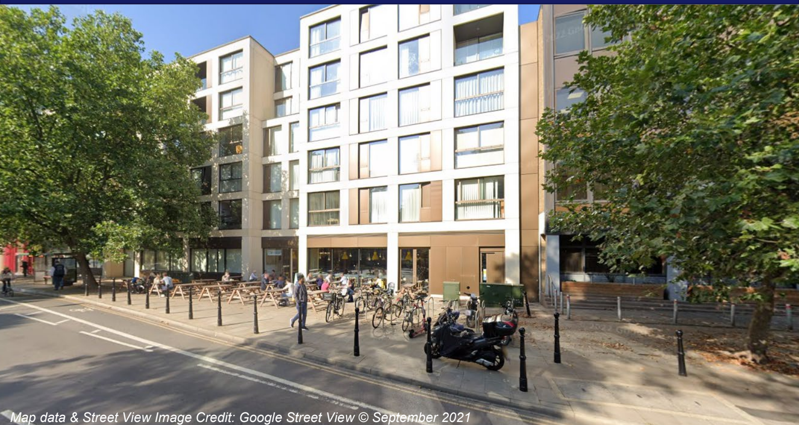
Map data & Street View Image Credit: Google Street View © September 2021