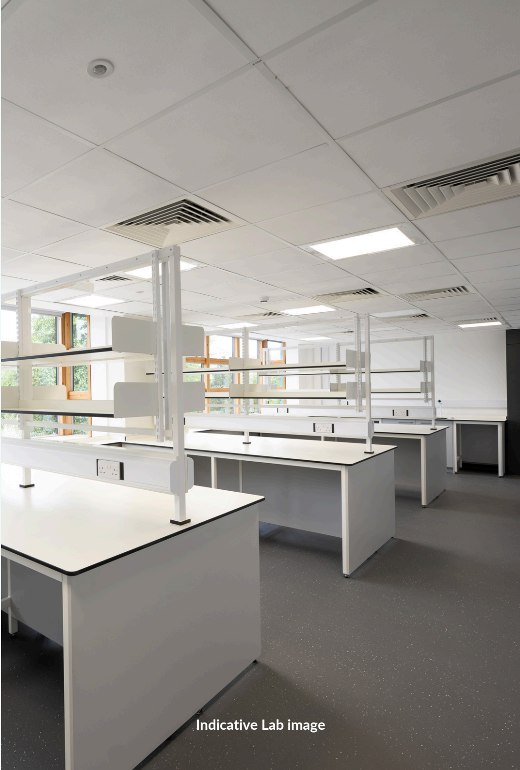
Indicative Lab image