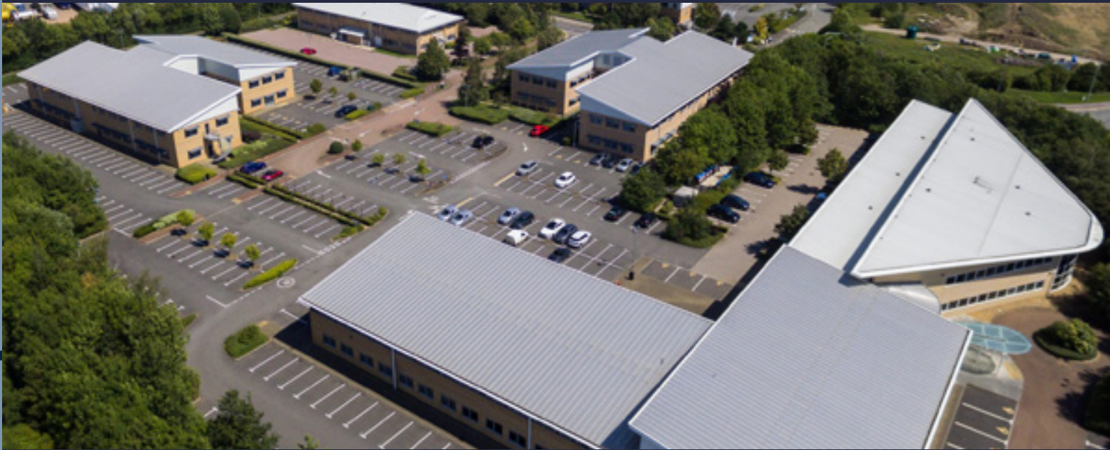
Aerial view of Cranfield University Technology Park