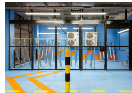
▲ New cycle hub and wayfinding