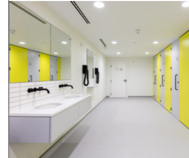
New showers and changing facilities ▾