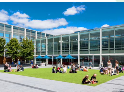
WITAN GATE HOUSE

Inviting green spaces are plentiful, making lunchtime a pleasure