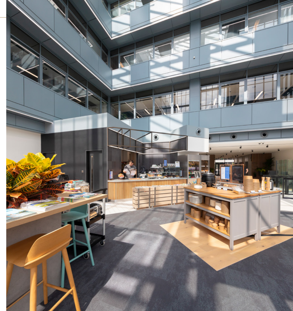
▲ Newly remodelled reception featuring an impressive atrium and independent café