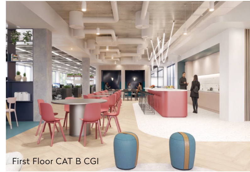
First Floor CAT B CGI