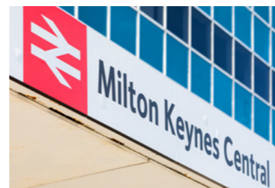
WITAN GATE HOUSE