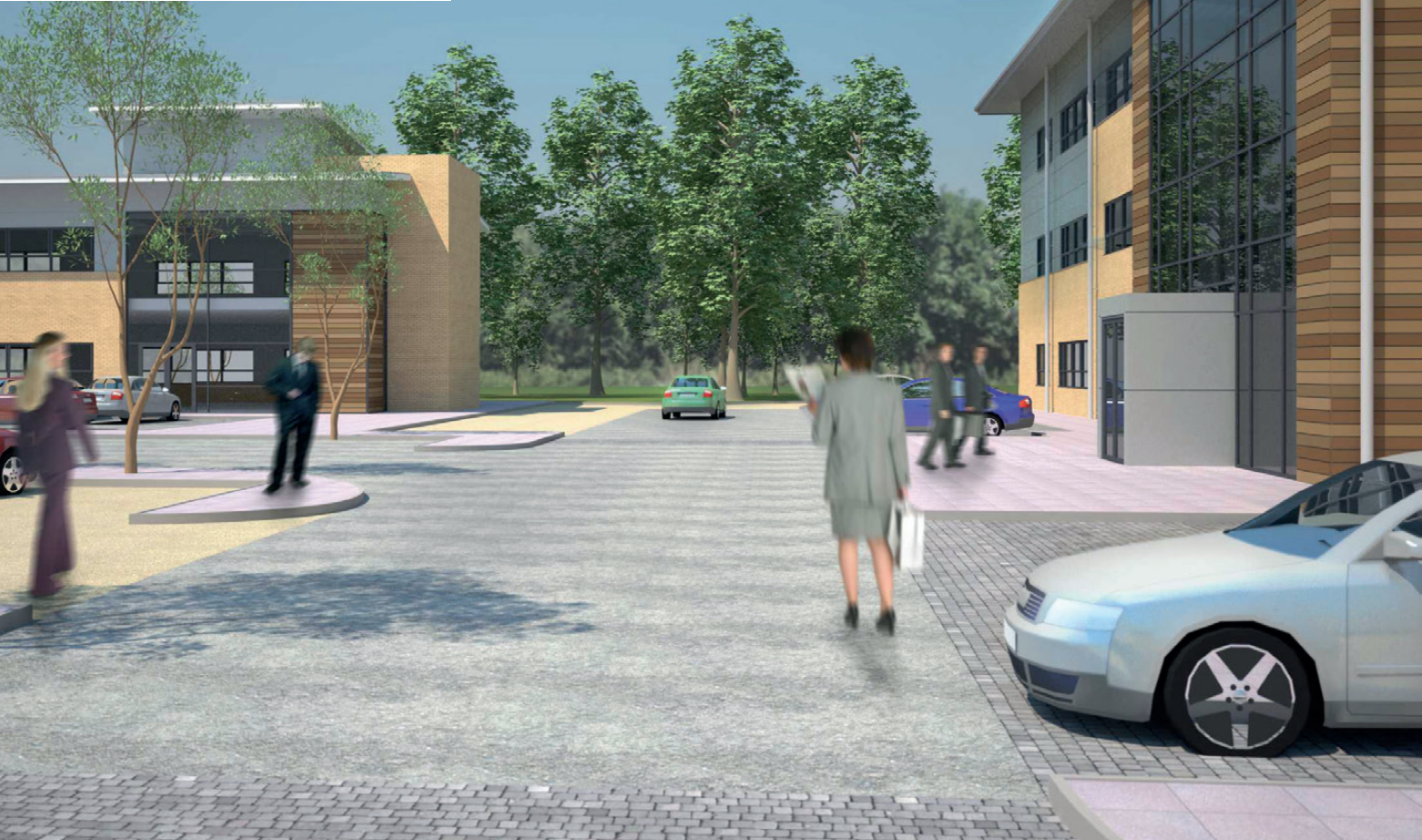
10,000 sq ft to 20,000 sq ft (929 sq m to 1,858 sq m). Available for pre-let.