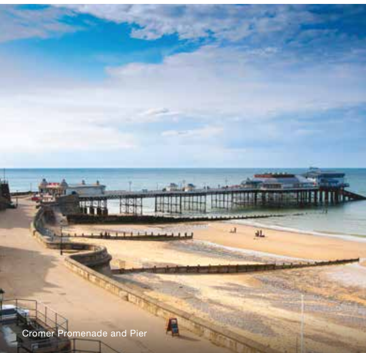
Cromer Promenade and Pier

In Holt and its surrounding areas, every corner reveals a new delight, whether it's a hidden tearoom, a scenic walking trail, or a charming coastal village. With a home at Park View you can immerse yourself in the timeless beauty and enchanting allure of North Norfolk – where every moment is an opportunity for discovery and wonder.