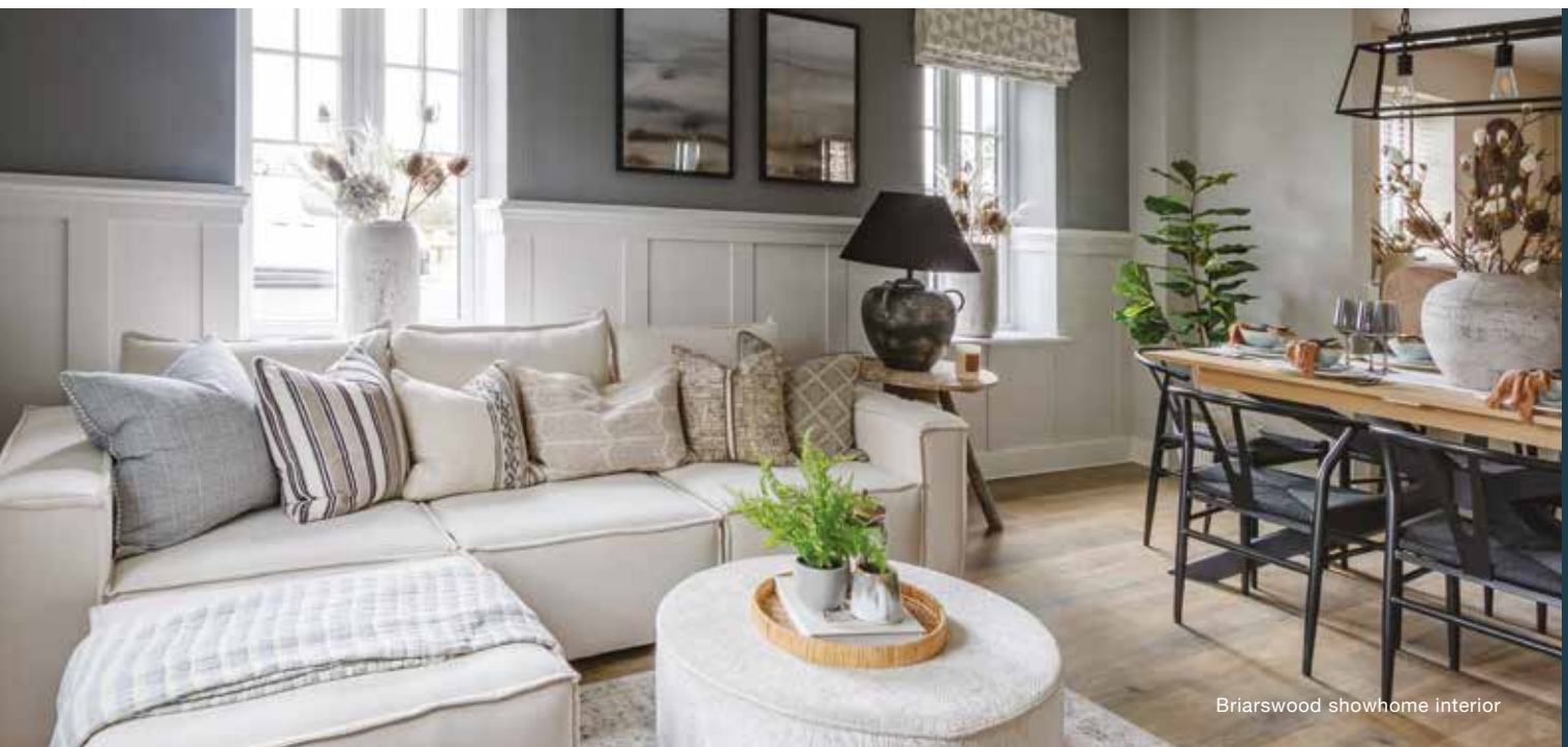
Briarswood showhome interior

Most of all, once you step through the front door, we want you to know you're home.