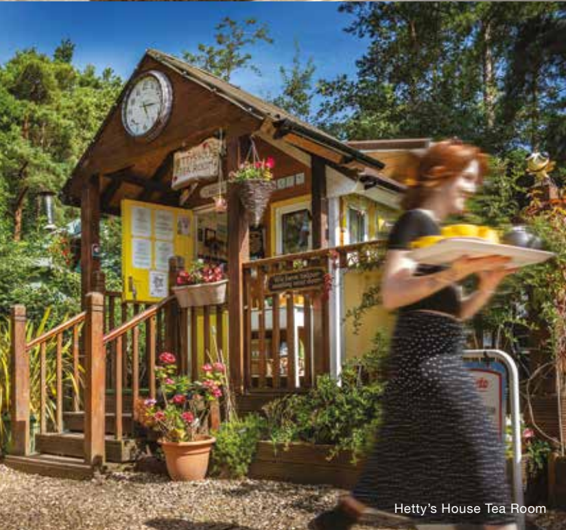
Hetty's House Tea Room