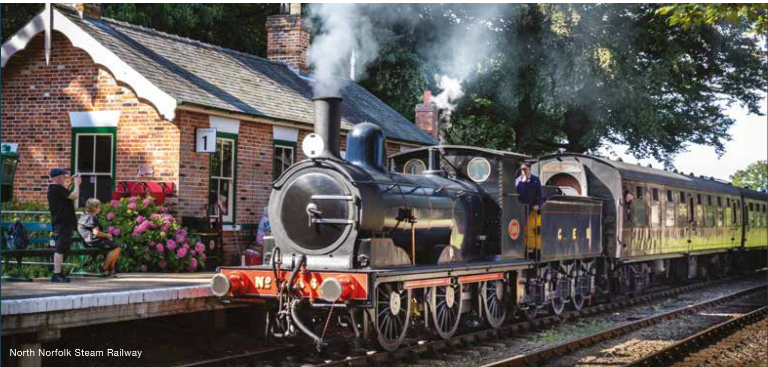
North Norfolk Steam Railway

Perfectly situated for travel on the A148, Park View is handily placed for exploring North Norfolk, with the seaside towns of Sheringham and Cromer less than 10 miles away. Alternatively, you can discover some of the county's most stunning scenery via the North Norfolk Railway, before changing at Sheringham for a mainline service to Norwich.