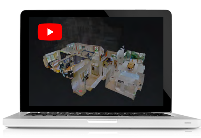
Video tours and floor plans are the perfect way to showcase your property to its fullest potential.

Our marketing approach will include a range of technology including 360 tours, video tours, floorplans and photography.